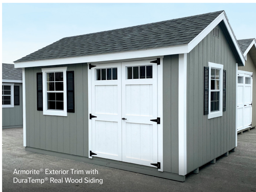
Armorite® Exterior Trim with DuraTemp® Real Wood Siding

With a U.S.-based supply chain, Armorite® Exterior Trim is ready for your next project.